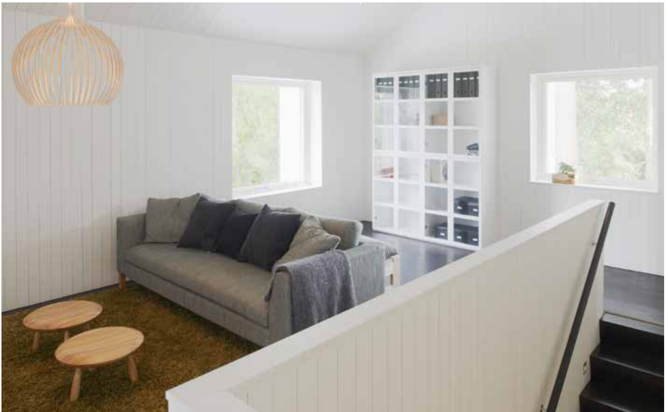
One Tonne Life house in Stockholm