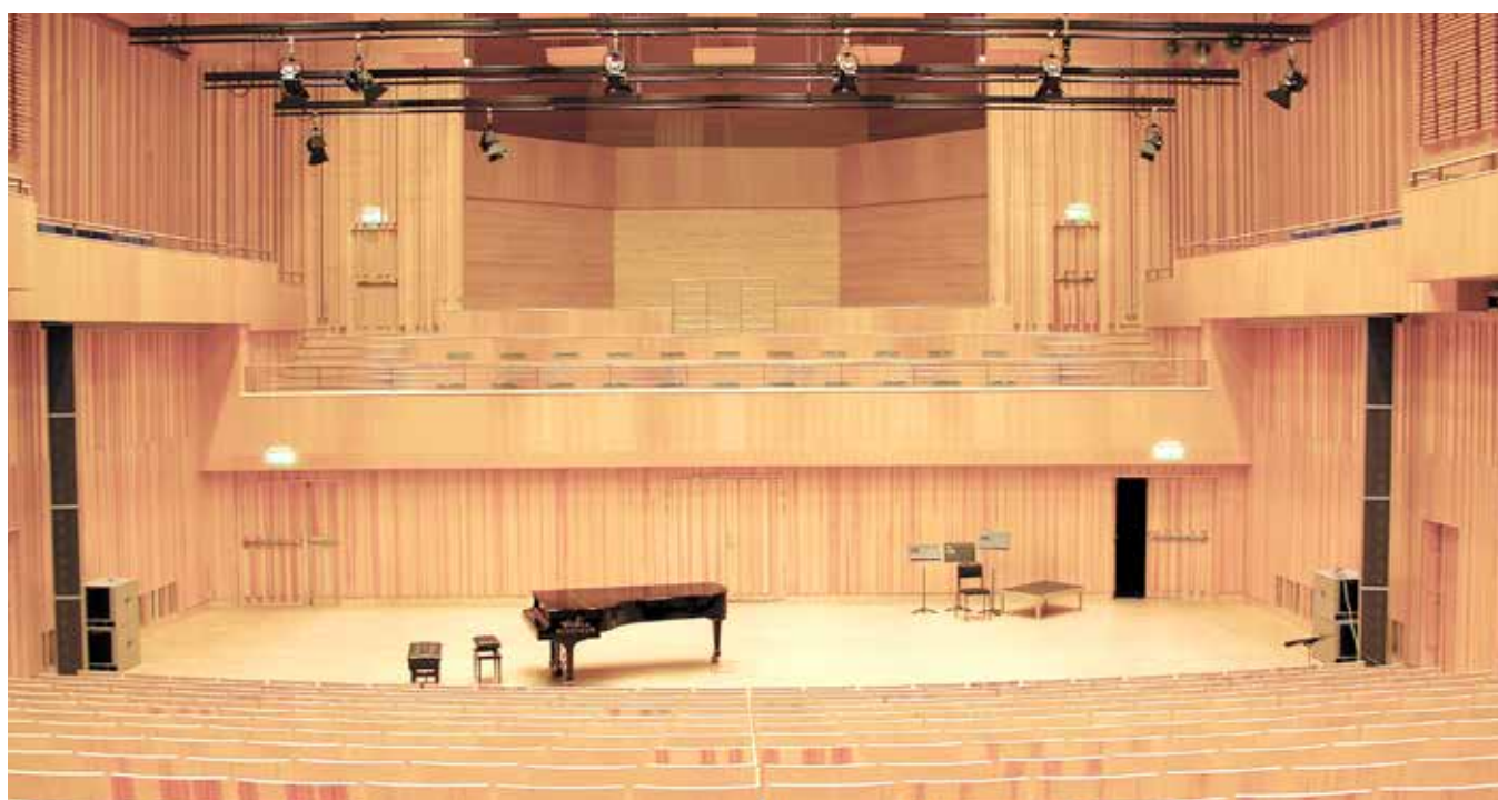
The auditorium Aucusticum in Piteå, Sweden.