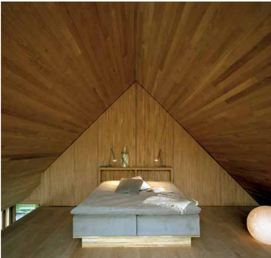
Kvarnhuset, Västra Karup